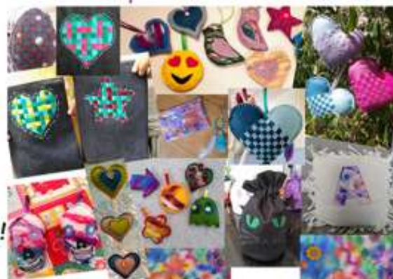
Typical OSC projects!

Scan QR code to go direct to booking form!